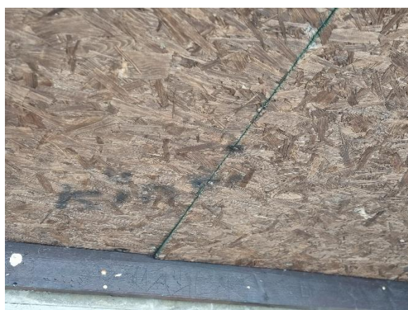
Chipboard on ceiling